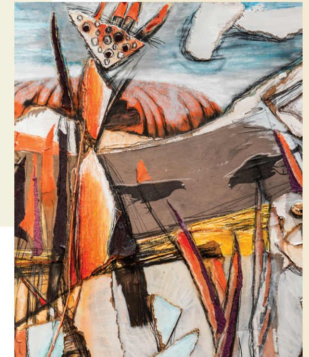
David Thorogood, Two Birds with Two Stones (detail), 2024 winner, 2D Acquisitive Award.