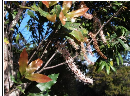
Macadamia ternifolia by Macadamia Conservation Trust

This species of macadamia is confined to the first line of significant hills West of the Pacific Ocean. A small, multi-stemmed tree which grows up to 8 metres tall with distinctive pink flowers. Unlike other macadamias, the Gympie Nut is toxic and inedible.