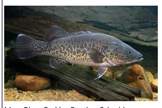
Mary River Cod by Gunther Schmida

Once more widespread throughout river systems in South East Queensland, it is now found exclusively in the Mary River catchment. The ideal cod habitat is thought to be deep, shaded, slow flowing pools with plenty of log-piles.