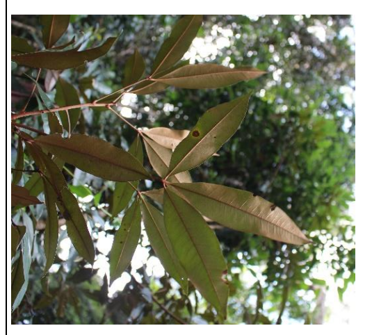
Copper Booyong (Argyrodendron sp. Kin Kin (W.D Francis AQ 81198)

This tree has a distinctive deep coppery colour on the underside of leaves. It is found in rainforests on less fertile or drier soils from Caboolture to Gladstone. A rainforest cabinet timber.