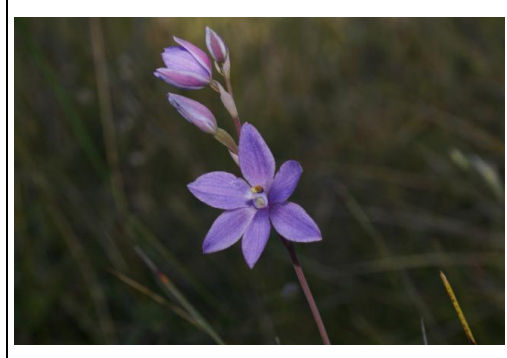
Thelymitra purpurata by Gordon Deans (CC BY)

A ground orchid found in the Cooloola area in wallum heath. It is known for its stunning flower colour and is sought after as a collectors' item by plant enthusiasts.