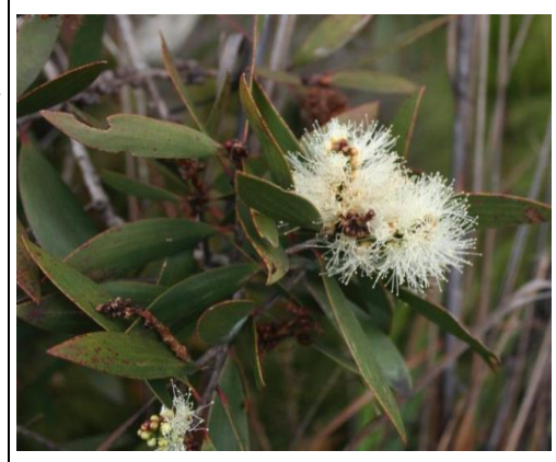
Melaleuca quinquenervia by Ian McMaster (CC BY)

A small tree that defines many vegetated wetlands in the Gympie Region and is from western parts to the coast. Much of its habitat was historically been cleared for pine plantations.