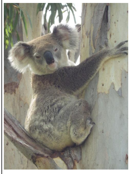
Koala – Widgee

An Australian icon, koalas are found throughout the Gympie Region, in open forest and woodland habitats where a select group of food trees are located. As koala populations in South East Queensland compete for space with a rapidly growing human population, Gympie Region's populations become increasingly important for sustaining genetic diversity and healthy populations.