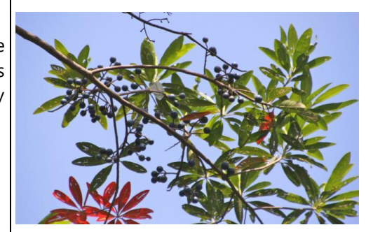
Elaeocarpus grandis by Ian McMaster (CC BY)

Known for its colourful fruit and cabinet timber qualities, the blue quandong is a fast growing rainforest timber that reaches 50 metres in height. The blue colour of the fruit is caused by refracted light, rather than by blue pigment.