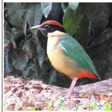
Noisy Pitta

A colourful local that is found in Gympie Region's rainforests and also in nearby forests, woodlands and mangroves. It is known to use stones as 'anvils' for cracking open the shells of snails and insects.