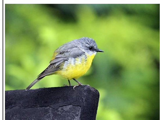
Eastern Yellow Robin

Found in a range of habitats from dry woodlands to rainforests, this bird is an excellent indicator of good environmental condition. They have habitat patches of 1 hectare or more and are a species that returns to restored habitat areas once reestablished. A favourite of the Gympie's backyards and bush patches.