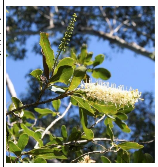
Macadamia integrifolia by Ian McMaster (CC BY NC/4.0)

A small to medium sized tree to about 15 metres with a bushy habit. Flowers are white and usually occur in winter and spring. It has proved to be hardy in a range of climates and soils but prefers good drainage and rich soils on South facing slopes. This is the edible variety of the Macadamia Nut and is planted commercially.