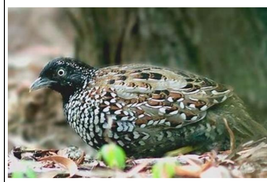
Black breasted Button quail

Rare buttonquail endemic to eastern Australia, where it is usually found in rainforest – it is threatened by clearing and predation by domestic and pest animals.