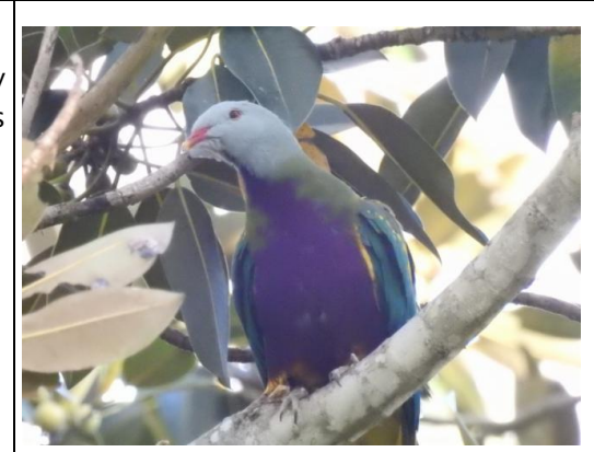
Wompoo fruit dove by Liz Scott (CC BY)

A spectacular fruit dove displaying bright colouration, but easily overlooked as it forages high in rainforest canopies. It's distinctive 'wompoo' call gives the bird its name.