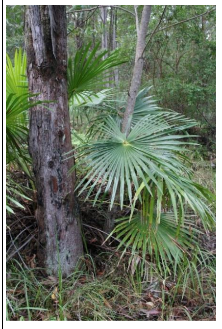
Livistona australis by Ian McMaster (CC BY NC/4.0)

This palm grows at a range of altitudes (0-1000 metres), in moist areas of open forest, swamp forest, along stream banks and in rainforests. It can form large colonies, like that seen in The Palms locality.