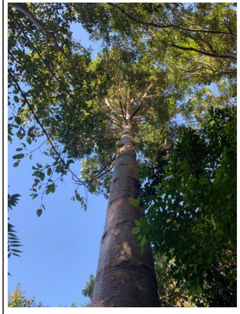
Agathis robusta by Charmaine Thomas (CC BY)

An emergent of lowland tropical rainforests. The Queensland Kauri occurs in two separate localities; a southern population is located in the Wide Bay area, and a northern population is located on the Atherton Tableland in North Queensland. This tree was heavily logged in the past, making large specimens rare in the wild.