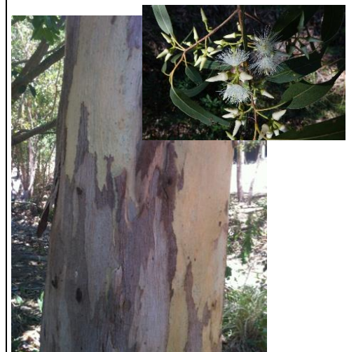
Eucalyptus tereticornis by Megan (1) and John Barkla (2) (CC BY NC/4.0)

One of the koala's preferred food trees, the blue gum grows in a range of environments across Gympie. Many river frontage environments across its range were cleared for agriculture, mining and plantation forests. The wood is hard and durable, and used for construction in heavy engineering, including railway sleepers.