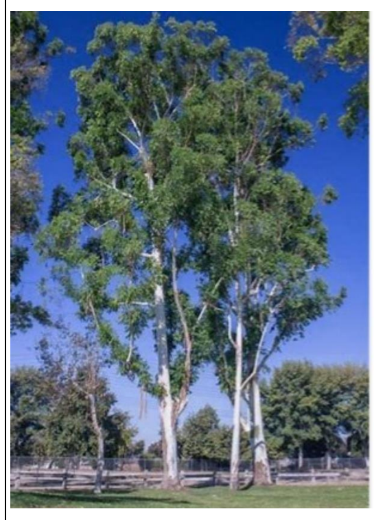
Flooded or Rose Gum

Eucalyptus grandis, commonly known as the flooded gum or rose gum, is a tall tree with smooth bark, rough at the base fibrous or flaky, grey to grey-brown. At maturity, it reaches 50 metres tall, though the largest specimens can exceed 80 metres tall. It is considered a koala food species.