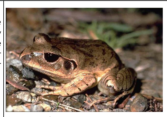
Great Barred Frog

Closely related to the Giant Barred Frog and grows to the same size (11.5cm). It is found in forests and woodlands and usually near permanent running water. They kick the eggs from the stream once fertilised, where they develop in moist leaf litter nearby. Adequate vegetated stream buffers are important for their life cycle.