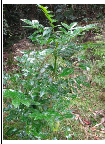
Flindersia australis by Craig Hodges (CC BY)

A forest tree that has showy cream flowers from September to February, decorative seed pods and is sought after as a durable timber.