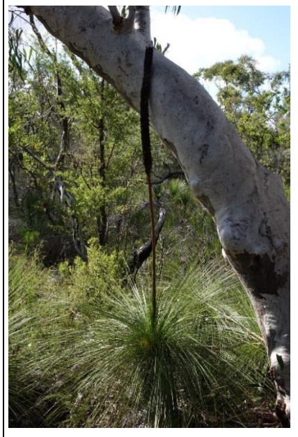
Xanthorrhoea fulva

This grasstree does not develop a trunk and is found in wet sandy soils. Ground Parrots cut thin stems of this grasstree to line their nests at ground level in the Cooloola wallum country.