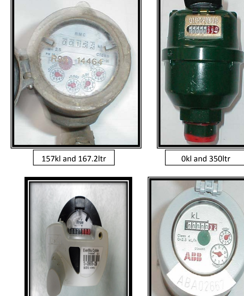
27kl and 755lt