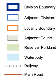
Location Map Division 8