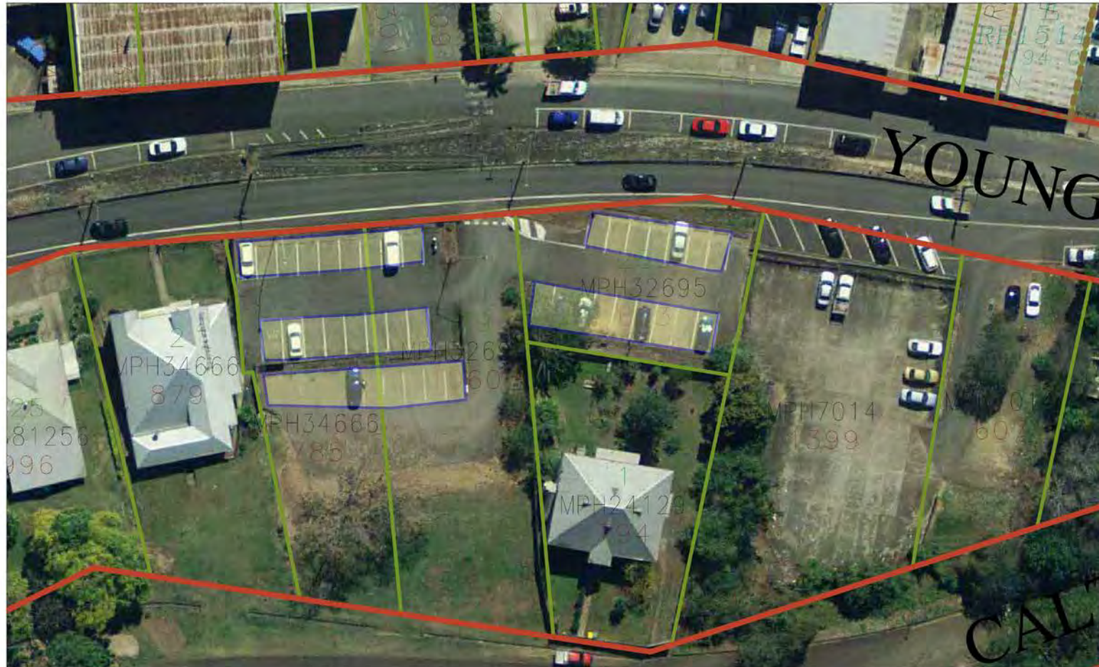
Map 6 – Young St car park