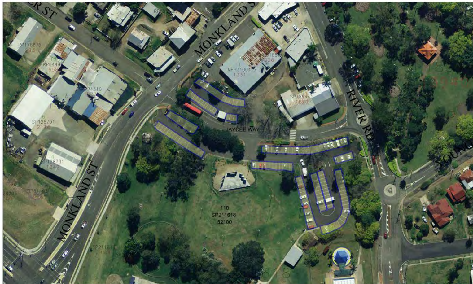
Map 5 – Jaycee Way car park