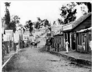
Nash Street, Gympie 1868

50 milestones that shaped a State TOP 150: Documenting Queensland 150 of the State's most significant historical documents Our Queensland Iconic photos of the memorable moments and people of our great state.