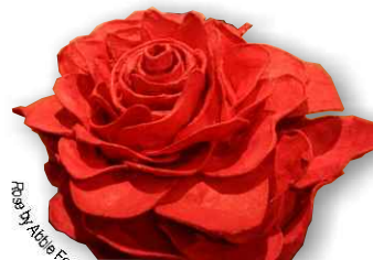
Rose by Abbie Fearnley (2008 exhibition)

Annual exhibition showcasing selected works from Gympie regional high schools Years 9 - 12. Will also include works by students in Years 11 and 12 doing Cert 3 in Visual Art and Contemporary Craft - School Links Program, TAFE.