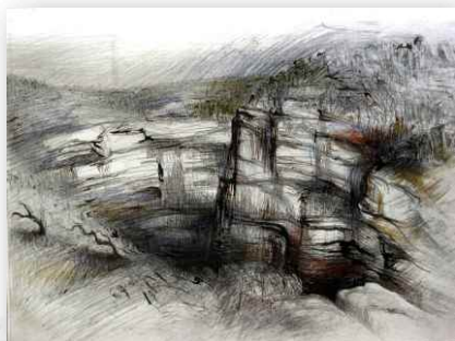
Blue Mountains Escarpment, Dr Christine Kirkegard

Drawings and mixed media works demonstrating excellence in structural drawing analysis and interpretation of place through rigorous study of landscape and the figure.