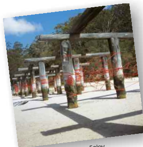
Signpost 1, 2005, Fiona Foley

Toured by Museum & Gallery Services Queensland, bringing together works from each of the Great Walks residencies. Presentation of 11 artists' extraordinary interpretations of a diverse range of environments, from the world's largest sand island to tropical rainforests.